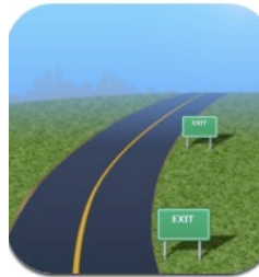
ROAD AHEAD Free

Wanna tricks your friends and family into believing you live in an action film. Download this free app. The app allows you to film a scene with your camera. Then add in an eye popping moment at the end of the scene. How about a 20 TON Rock dropping from the sky and smashing your car? You won't believe the visuals on this app.