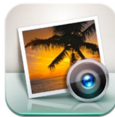
IPHOTO IOS $4.99 iphone / ipad

If you have been looking for the perfect (yet not cheap) solution to your virtual recipe box? Look no further. Paprika allows easy entry and recipes you have hand written. Best of all it allows copying of recipes off the web in a Manual one button process, or Automatically for a large number of Cooking sites. Best of all it stays in sync with Iphone, Ipad, and your Mac