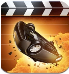
ACTION MOVIE Free

Wanna tricks your friends and family into believing you live in an action film. Download this free app. The app allows you to film a scene with your camera. Then add in an eye popping moment at the end of the scene. How about a 20 TON Rock dropping from the sky and smashing your car? You won't believe the visuals on this app.