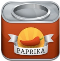
PAPRIKA $4.99 iphone / $4.99 ipad $19.99 OS X

Cash in your change jar... these gonna cost ya